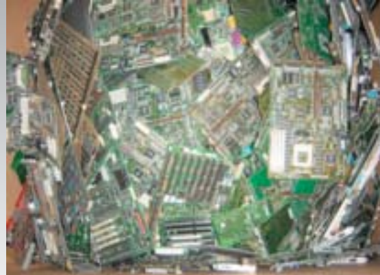
There were many boxes like this one full of motherboards.