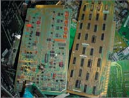
"There's GOLD in them there boards!"