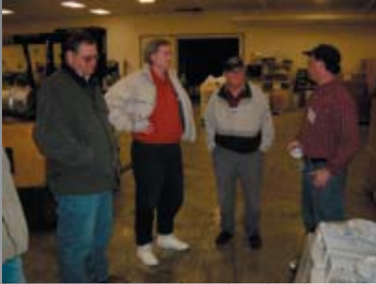
Members get a chance to ask questions about the company.