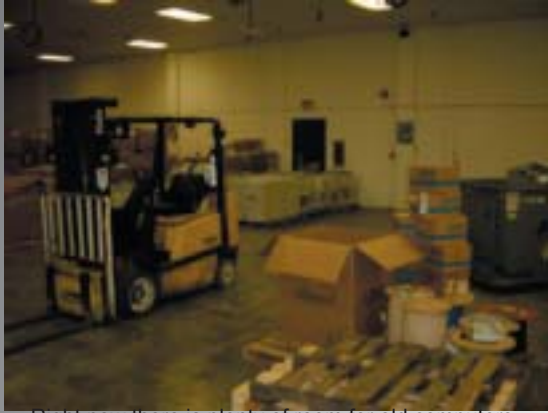
Right now there is plenty of room for old computers.