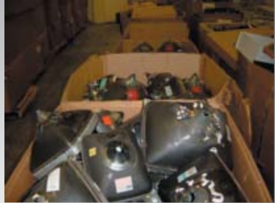
Old monitor tubes ready to be crushed to make new monitor tubes.