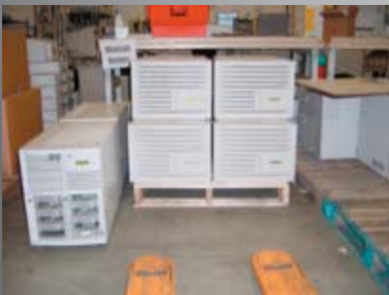
This is a recently received batch of HP Servers.