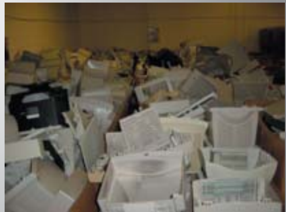
Boxes upon boxes of old computer and monitor cases.