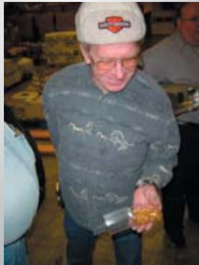
That container is full of solid gold connectors