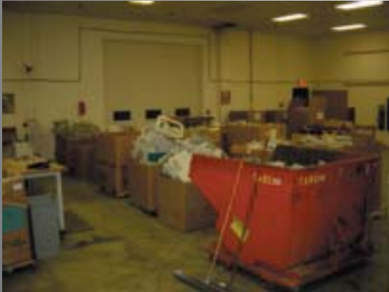
Computer parts everywhere.