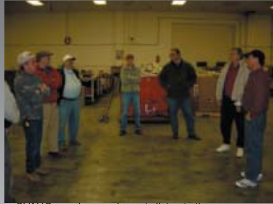
CVAUG members and guests listen to the process.