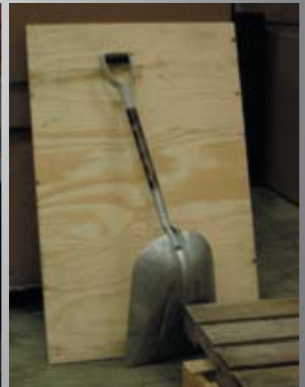
Crushed computer clean up tool.