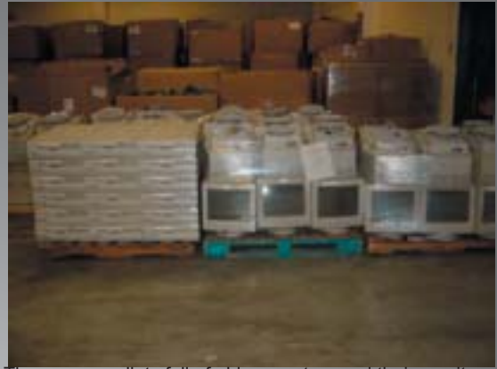
There were pallets full of old computers and their monitors.