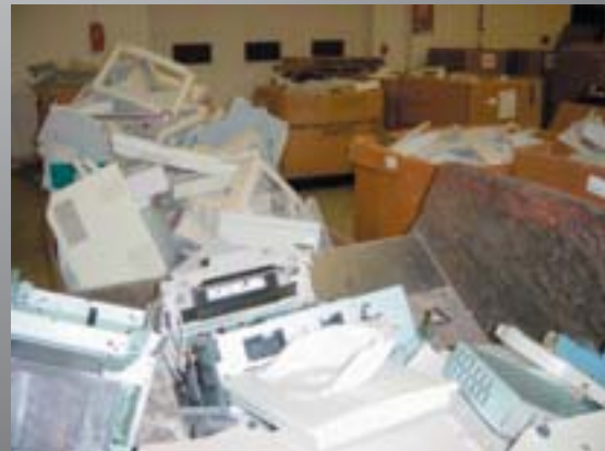
More computer shells.