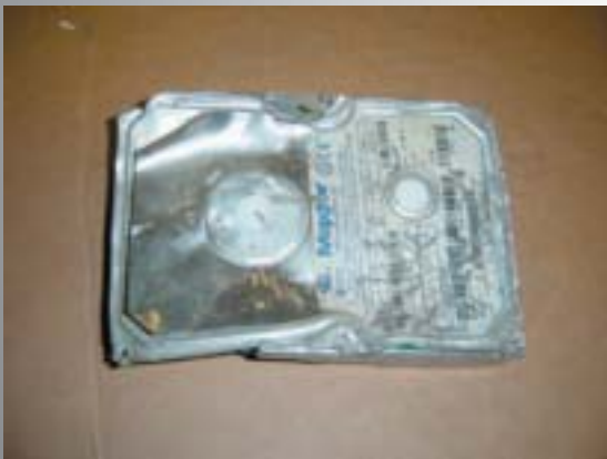
I don't think you'll get too much useful data off that Hard Drive.