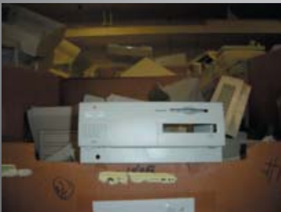
I did manage to find a Power Macintosh 7300 case.